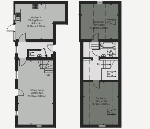
STABLE COTTAGE - GROUND FLOOR STABLE COTTAGE - FIRST FLOOR (NOT SHOWN IN ACTUAL LOCATION / ORIENTATION)